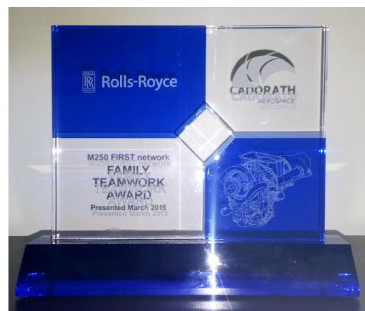
Rolls-Royce M250 FIRST Network Award for Family Teamwork awarded to Cadorath Aerospace of Winnipeg on March 2 in Orlando, Florida.

owned and operated. The Cadorath Group provides superior solutions and products to a global client base through its group of companies located in: Winnipeg, MB Canada, Lafayette, LA U.S.A. and Orion, IL U.S.A. Cadorath Aerospace – Cadorath Distribution - Cadorath Coatings – Cadorath Uniflyte – Meridian Helicopter