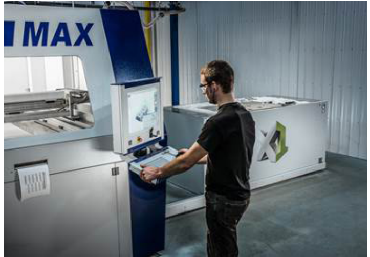
Magellan Aerospace uses additive manufacturing for their sand casting process, and are excited to develop core capabilities in aerospace metal additive manufacturing.

This funding will stimulate additional private investment into the Hub. Stratasys Direct Manufacturing, a world-renowned additive manufacturing company, will establish its first Canadian manufacturing facility in Winnipeg. Magellan Aerospace, an aerospace manufacturing company, has committed significant R&D investment in the Hub to develop core capabilities in aerospace metal additive manufacturing.