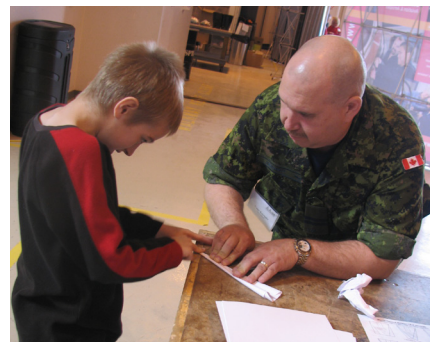
A student learning about the principles of flight while making an airplane

1. Aircraft Inspection: students learn to identify parts of aircraft by taking on the roles of aircraft maintenance engineers on inspection