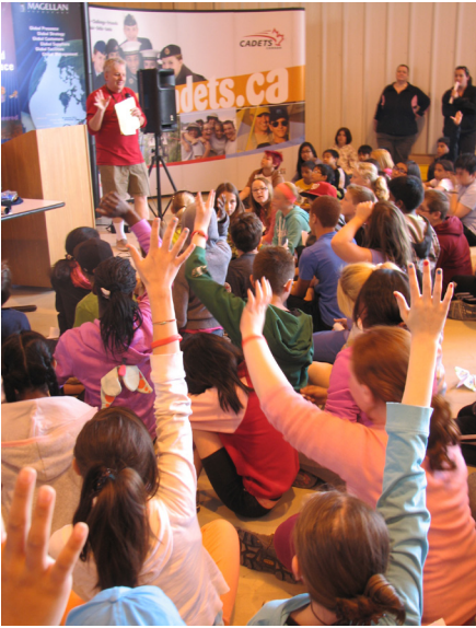
Students answering questions at the end of the event

The first Friday after the May long weekend has been designated as the annual Aerospace & Aviation day in Manitoba (AAiM). The program brings together the aviation and aerospace communities to provide a learning experience for Grade six students.