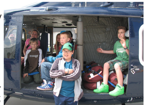
Students posing inside a military search and rescue helicopter